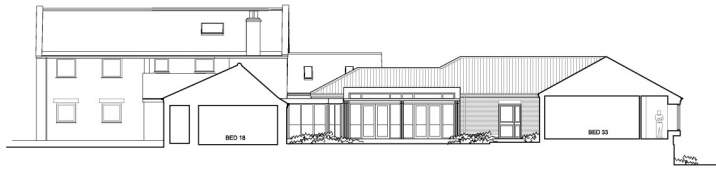
COURTYARD ELEVATION LOOKING NORTH