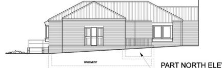
PART NORTH ELEVATION